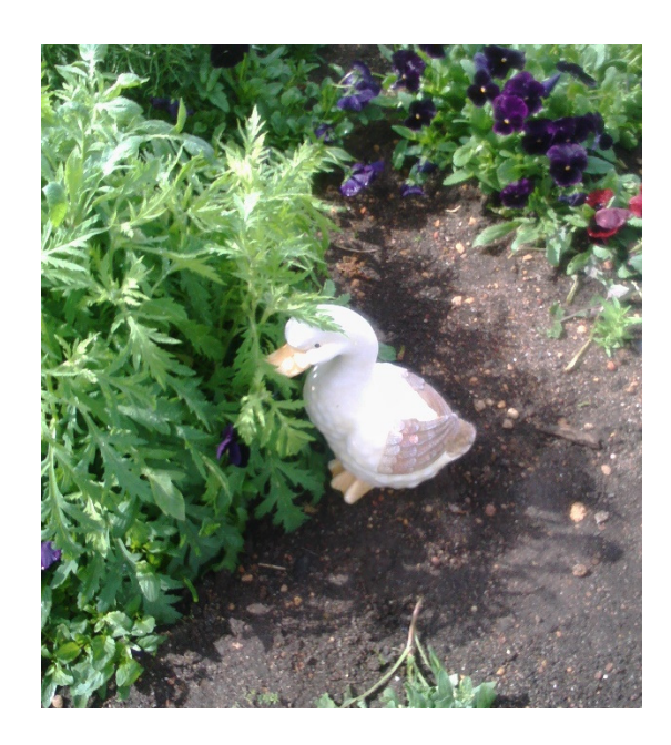
Security guards appeared to be distracted or looking the other way suggesting, it may be an inside job . . .