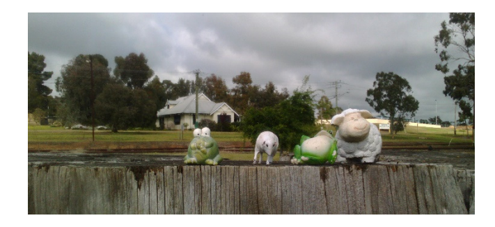
Perched on his throne and sunning himself, the frog implied that maybe a rustler had infiltrated the flock.