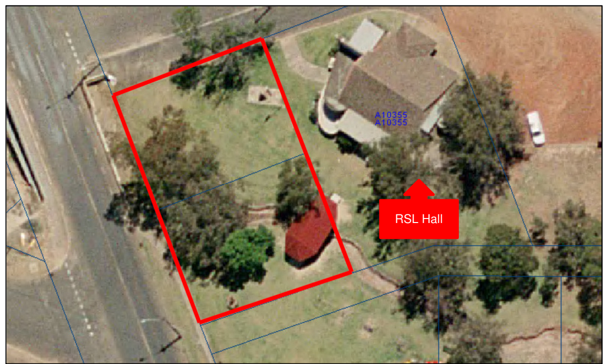
Map showing Reserve 25465 (adjoining RSL Hall lot)

The above map shows the adjoining Council reserve and the RSL Hall lot to the East.