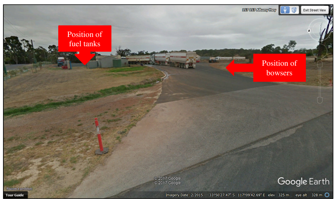
Street view image showing transport depot site and proposed position of fuel tanks/bowsers

The applicants advise due to the size the new facility will require a Dangerous Goods Storage and Handling Licence from the Department of Mines, Industry Regulations and Safety (DMIRS) and will comply with all relevant regulations and standards. The applicant has engaged a consultant who is authorized by DMIRS to certify installation for licencing.