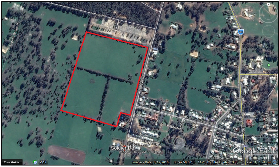
Lot 101 Soldier Road, Kojonup bordered in red

Lot 101 Soldier Road is located immediately south of the Cemetery as shown in the image below: