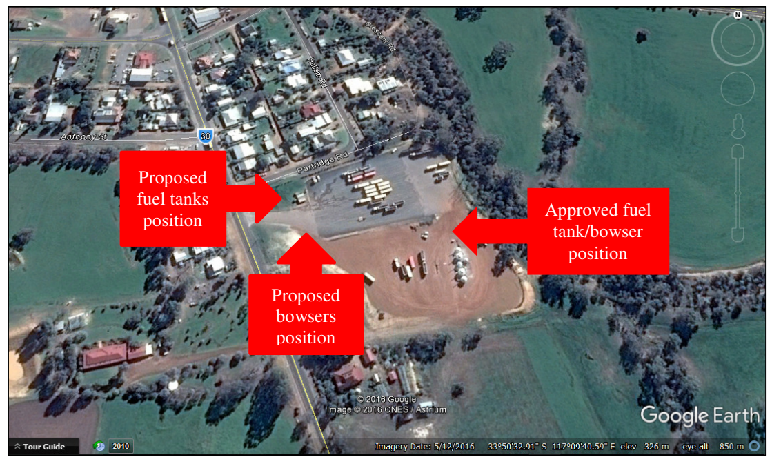
Aerial image showing transport depot site and approved/proposed position of fuel tanks/bowsers

TPS 3 has 11 conditions applying to the site and conditions 1, 3 and 8 are relevant to the request from Matthews Transport. They state: