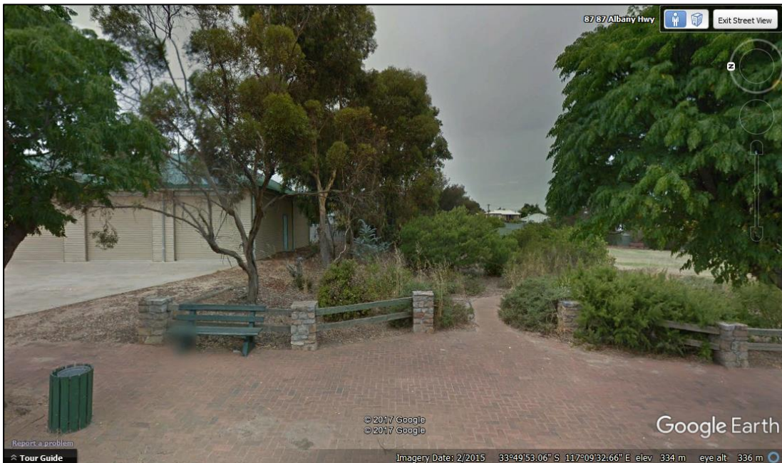
Street View from Google Earth showing ambulance building and existing gate, path and garden area in Hillman Park

There are no planning grounds in the TPS3 that would prevent the proposal to annex a portion of land from Hillman Park (Local Reserve for Recreation) and include it within the land for Ambulance Depot (Local Reserve for Public Purposes) if Council wishes to support the proposal. If approved, the change in reserve status from Recreation to Public Purposes can be accommodated within the new planning scheme.