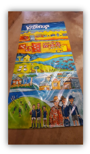
The amazing banner designed and painted by St. Bernard's for the "Banners in the Terrace" competition, 2018.

While the Shire has not had a confirmed date that the banner will be hung for display, the banner has already received compliments from WALGA. Well done, team!