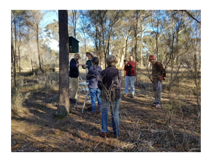
Checking a nesting box