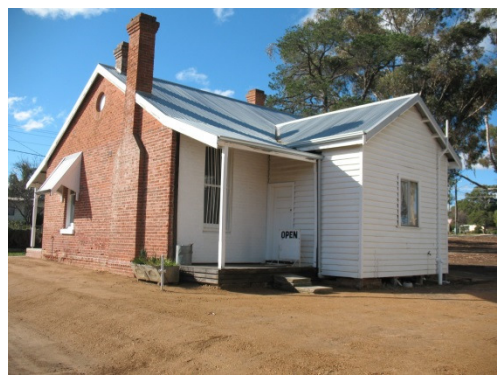
Remediation of the site has now occurred.