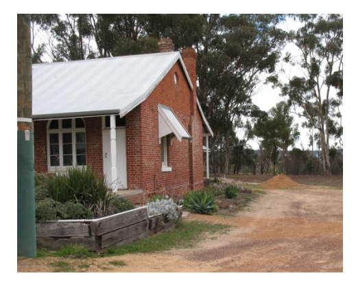
Before: stormwater undermining footings and brickwork.