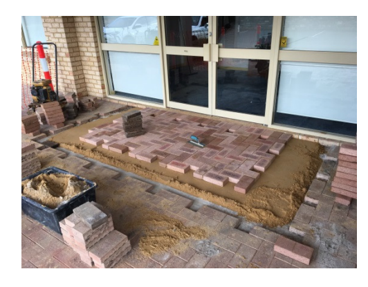
Improved disability access