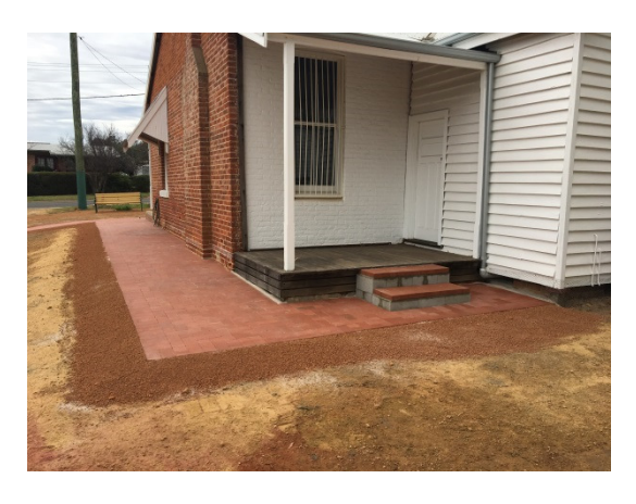
The Old Post Office now features enhanced drainage and improved disability access.