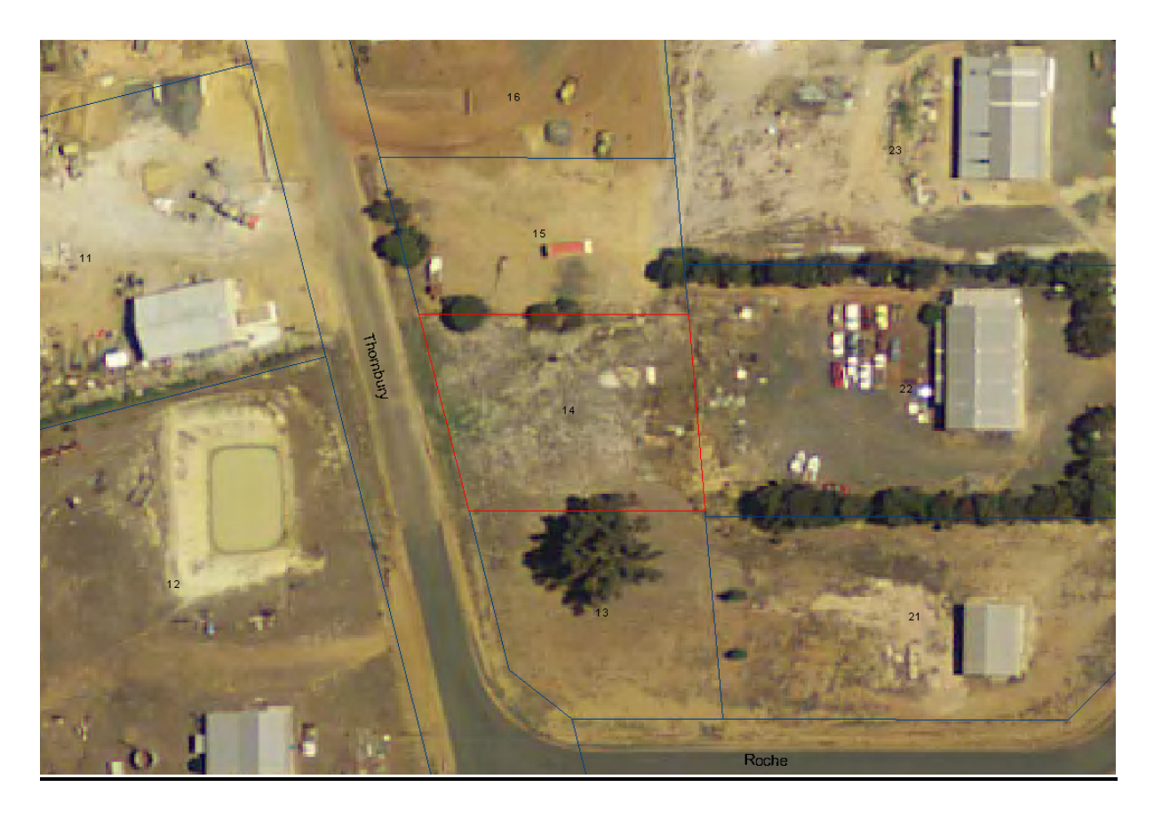
Lot 14 Thornbury Close

Section 3.58 of the Local Government Act 1995 states: