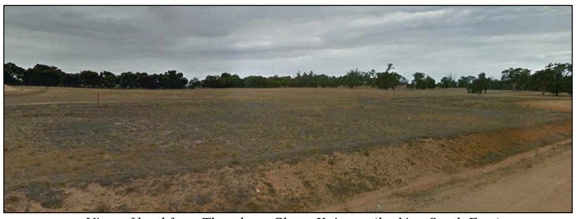
View of land from Thornbury Close, Kojonup (looking South East)