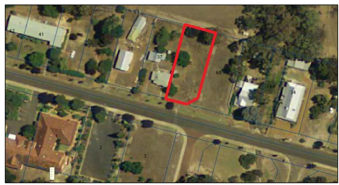
Lot 36 Spring Street, Kojonup showing truncation bordered in red.

The proposed site and a shelter structure had previously been discussed with the builder onsite and was supported by staff. The shelter structure was to be constructed of frames with no walls and a translucent sheet roof with no formal driveway constructed. The formal proposal submitted involves a shed with Colorbond metal sheeting walls and roof and a paved formal driveway.