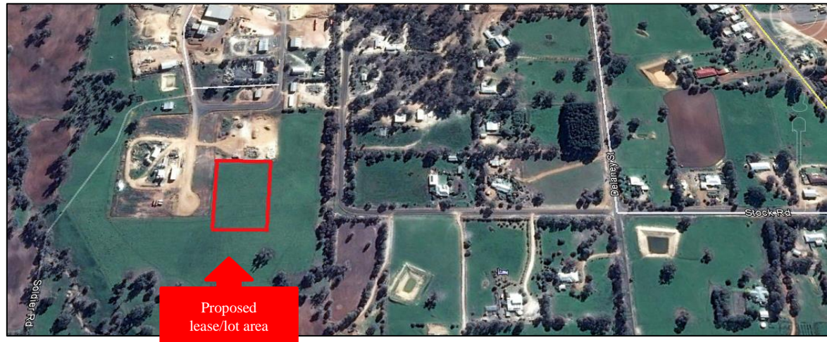
Aerial view of proposed site

The proposed land to be used for the grain cleaning business is shown bordered in red in the image below.