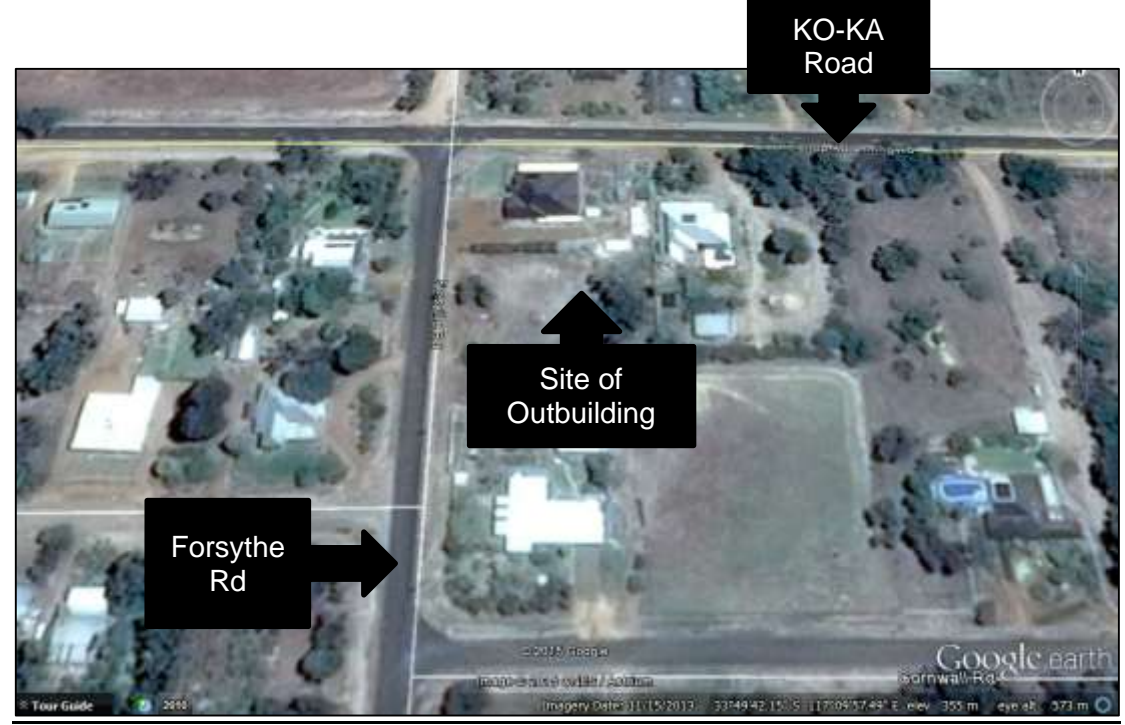
Proposed site of outbuilding

The proposal is to construct a new 8m x 12m gable roof outbuilding (wall height of 4.5m and ridge height of 5.3m) on the above lot as shown below. The proposed site of the outbuilding will require 3-5 small redgum trees to be cleared. The outbuilding will be used to store personal effects and vehicles including a caravan.