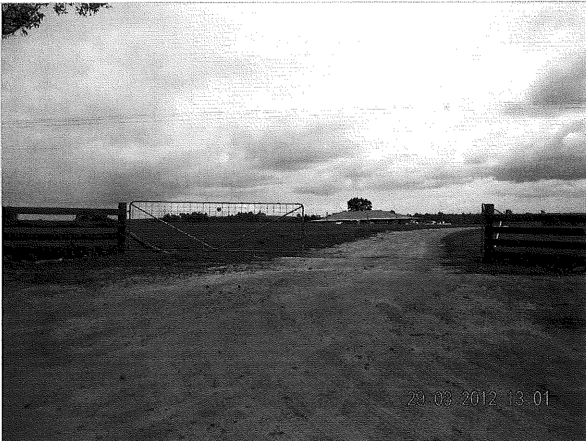
Looking west from Treasure Road to Dwelling (Outbuilding to be constructed south of dwelling)

The site of the outbuilding (adjacent to the recently completed dwelling) is near to the top of the local hill and the outbuilding (as is the existing dwelling – see image below) when constructed will be visible from some lots and areas outside of the lot. The lot is in excess of 13 hectares, which is substantially larger than the 'average' 2 – 5 hectare lots in the zone and the oversized outbuilding is considered consistent with the lot area and use.