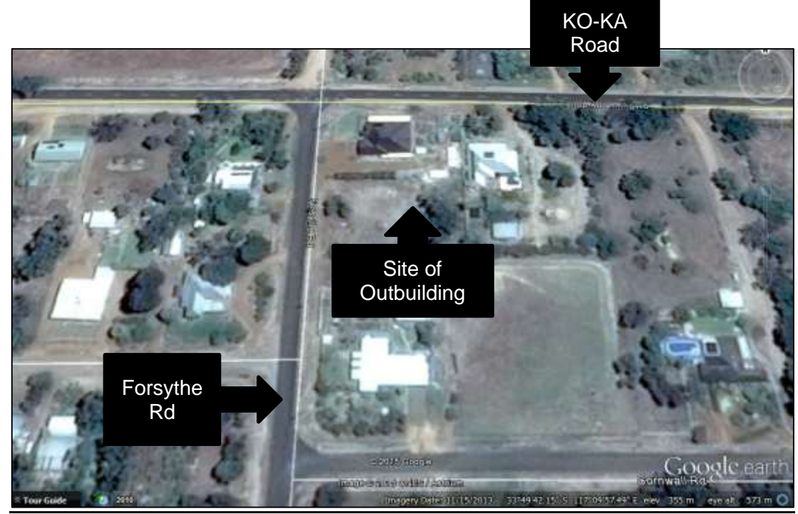
Proposed site of outbuilding

The proposal is to construct a new 8m x 12m gable roof outbuilding (wall height of 4.5m and ridge height of 5.3m) on the above lot as shown below. The proposed site of the outbuilding will require 3-5 small redgum trees to be cleared. The outbuilding will be used to store personal effects and vehicles including a caravan.