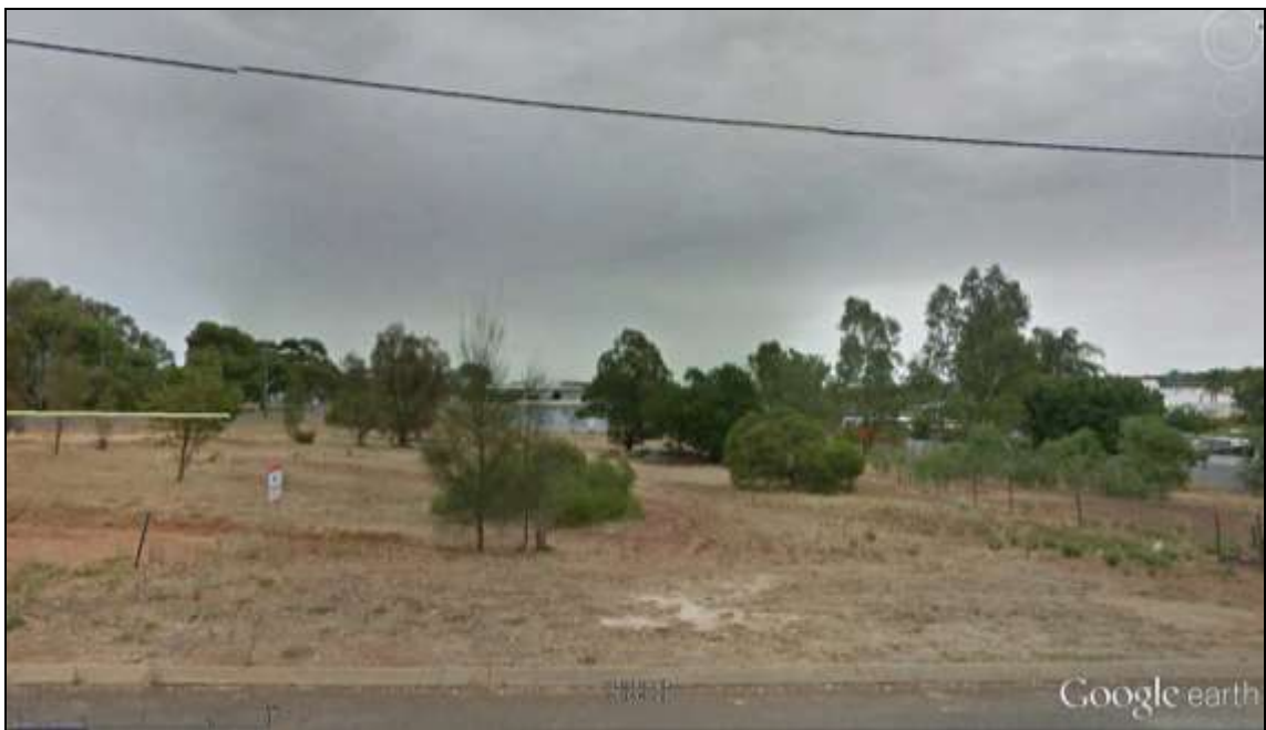
Street View of Lot 14 (No. 86) Pensioner Road, Kojonup looking West