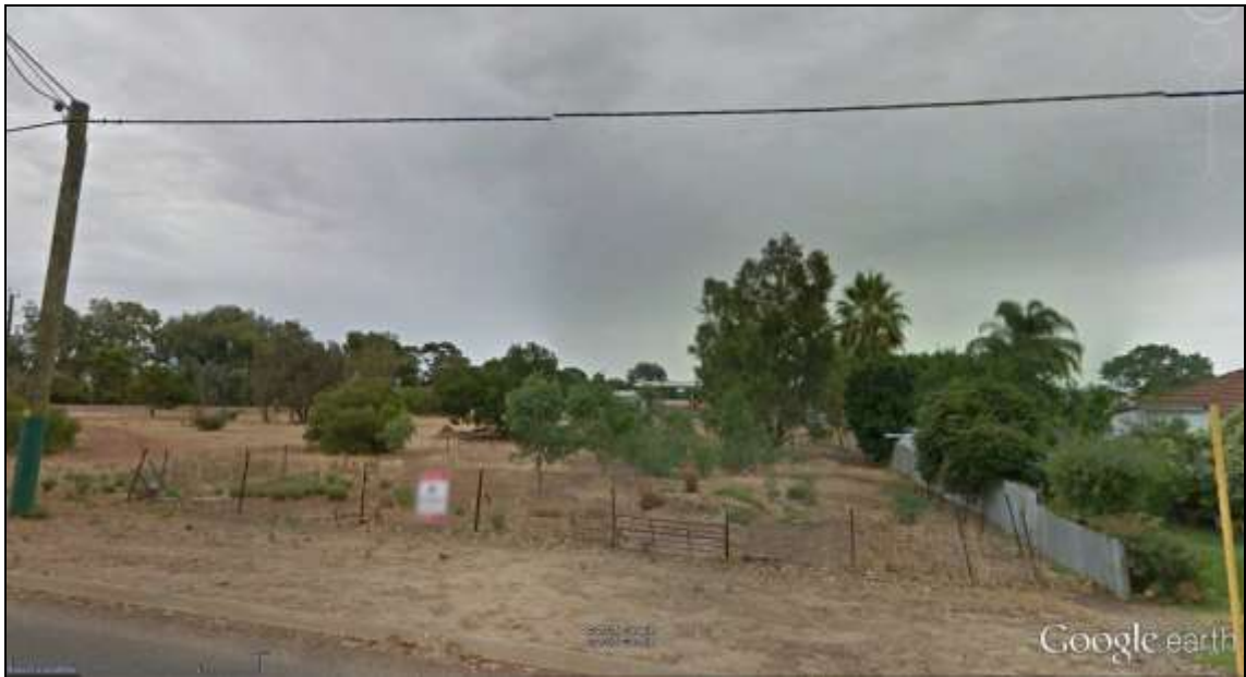
Street View of Lot 13 (No. 84) Pensioner Road, Kojonup looking west showing treed area along adjoining residential property