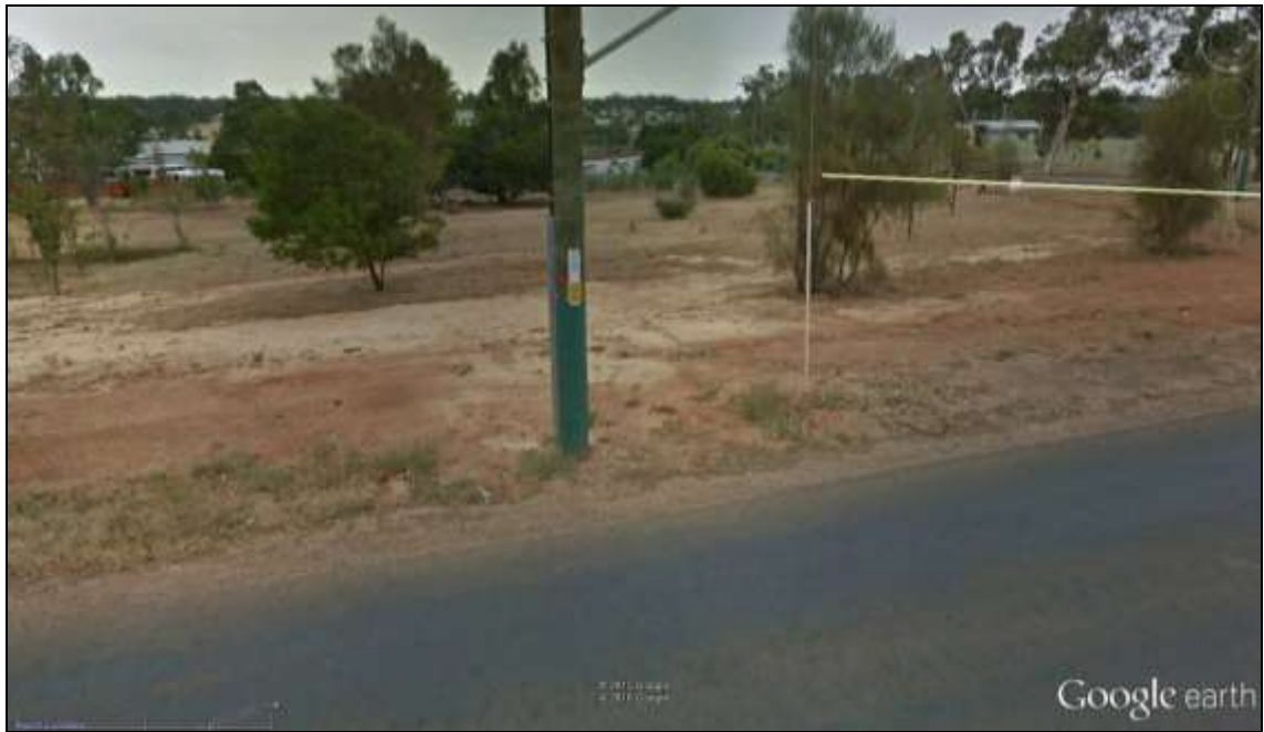
Street View of Lot 15 (No. 88) cnr. Blackwood & Pensioner Roads, Kojonup looking North (Image Google Earth)