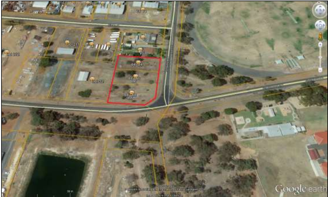
Lots 13, 14 & 15 (no's 84-88) cnr. Blackwood & Pensioner Roads, Kojonup (bordered in red)

The lots total 3,225m 2 in area. The lots have access to reticulated water and telecommunications and electricity supplies. No sewer is available to the lots. Blackwood and Pensioner Roads area sealed with kerbing and some stormwater infrastructure available.