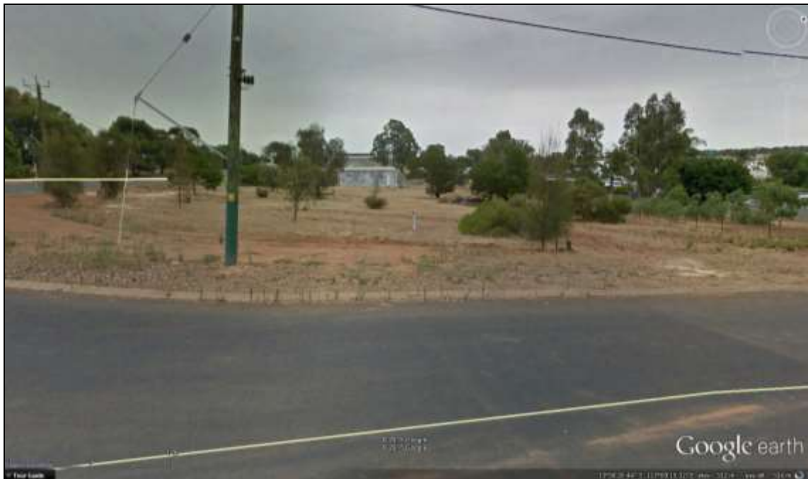
Street View of Lot 15 (No. 88) cnr. Blackwood & Pensioner Roads, Kojonup looking West