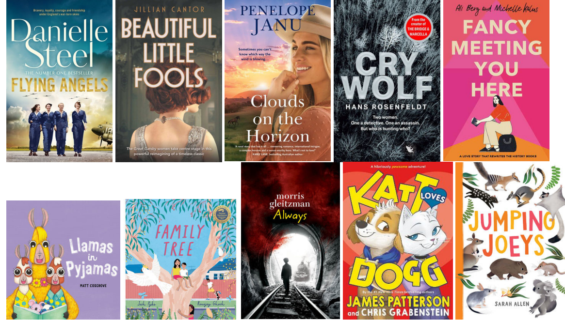
Please like our FaceBook page, we share new books every day for your reading pleasure.

What did the world's first playgrounds look like? What do families all over the world eat for breakfast? How did dinosaurs look after their babies? In this compendium of 5-minute really true stories you will meet all types of family – human and animal! – and learn about the many ways they spend time together. From family bicycle rides to animal migrations, and from tidy up time to cosying up with pets, discover the amazing science and history of family activities. With up-to-the-minute, expert information and stunning illustrations, this book will bring out the joy of the everyday things we do at family time.