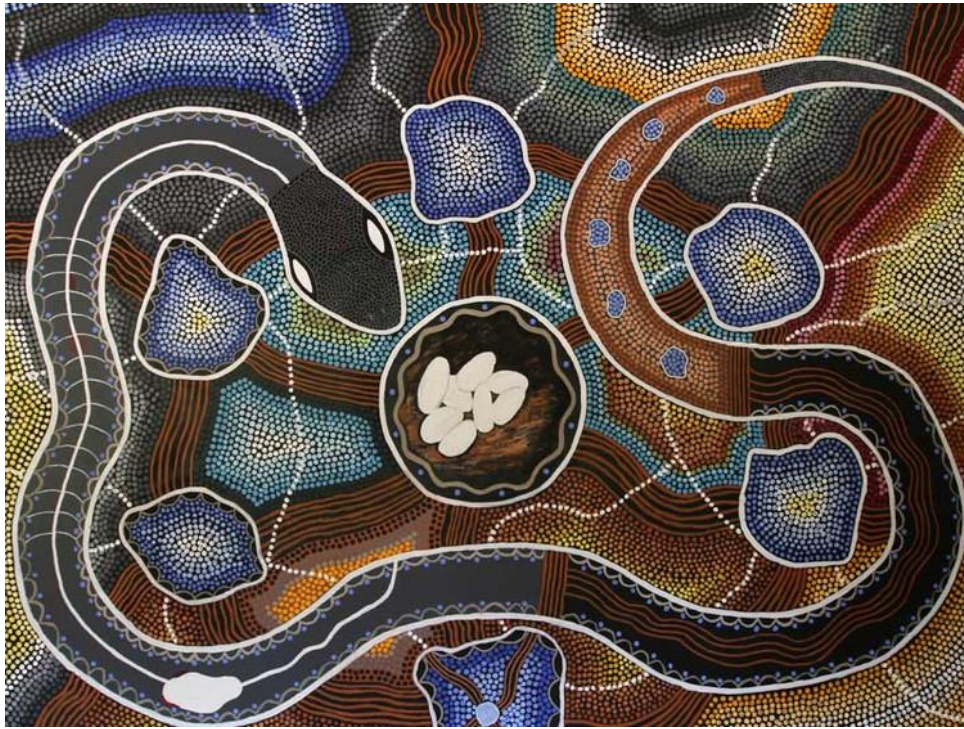
'Y-INAGN' (Creation) by local Noongar artist Craig McVee