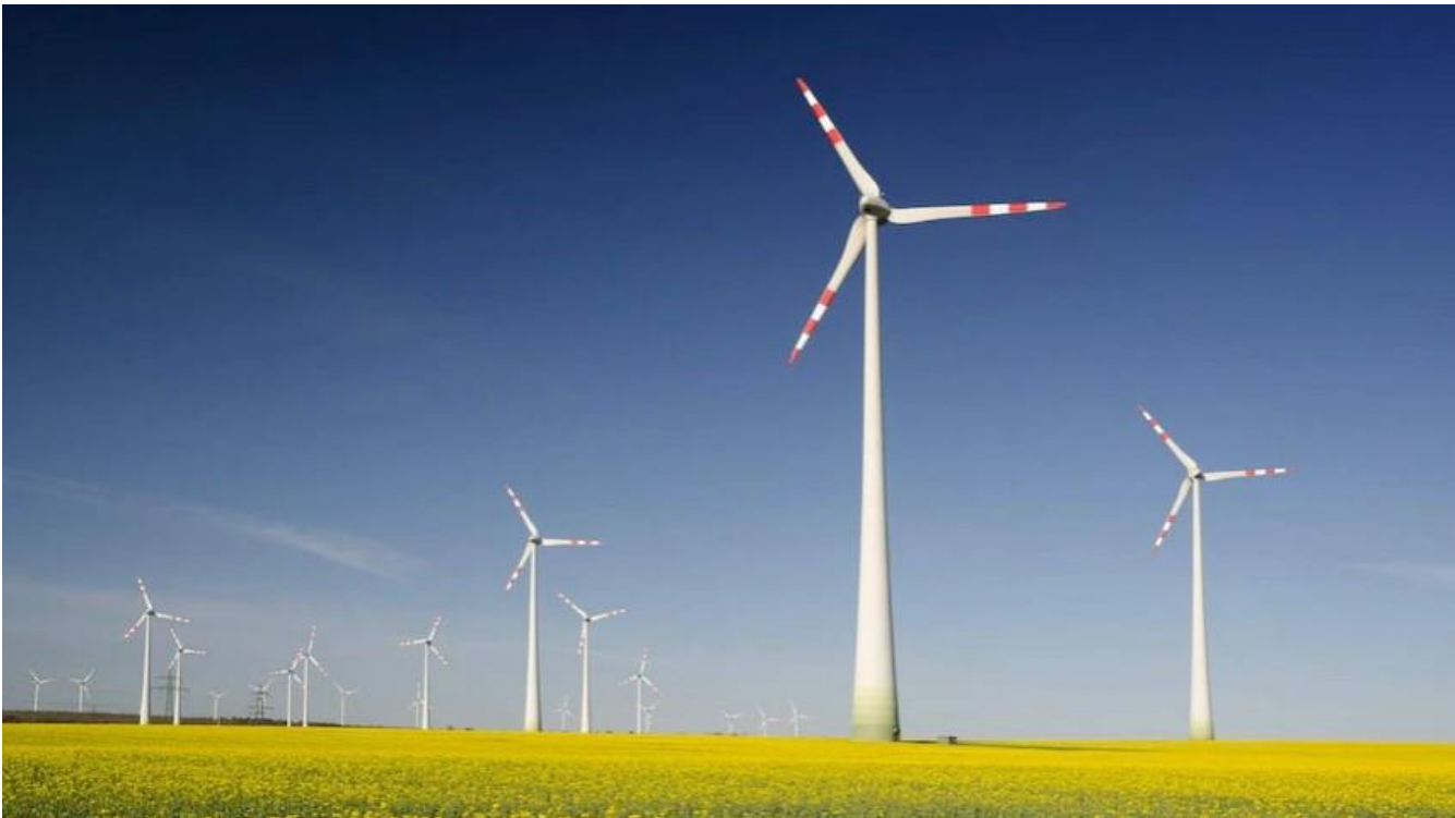
Figure 1A turbine wind farm proposed for farmland near Kojonup is a step closer after passing a state planning panel.

THIS ARTICLE HAS BEEN TAKEN FROM ABC.NET.AU