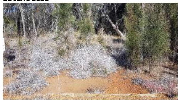
11 June 2019