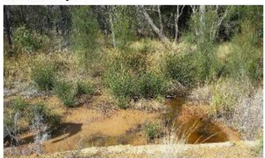
Collie-Changerup Road Demonstration Site 17 February 2017