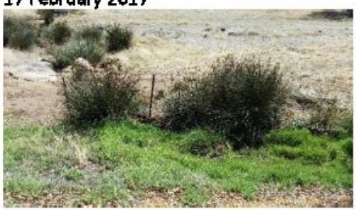
Kojonup-Broomehill Road Demonstration Site 17 February 2017