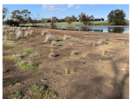
The fresh water lake before and after treatment.

Fire - we follow up burned just before the beginning of the fire season last spring on 2018 - this has been effective in reducing the height and we intend to spray and burn (and dig out lesser colonies).