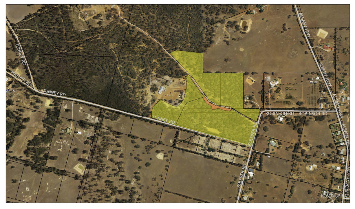
Weeding Wattles Busy Bee Progress total area = 15.04Ha

The next busy bee will be held on Wednesday the 6<sup>th</sup> of June from 8:30am.