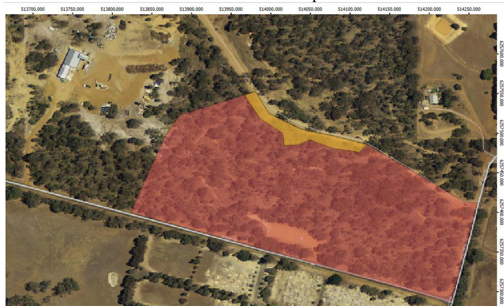
Weed removal map

The following weeding day will be to continue the removal of the above weeds to the Recycling Depot boundary and then begin on the northern side of the Old Rubbish Tip road.