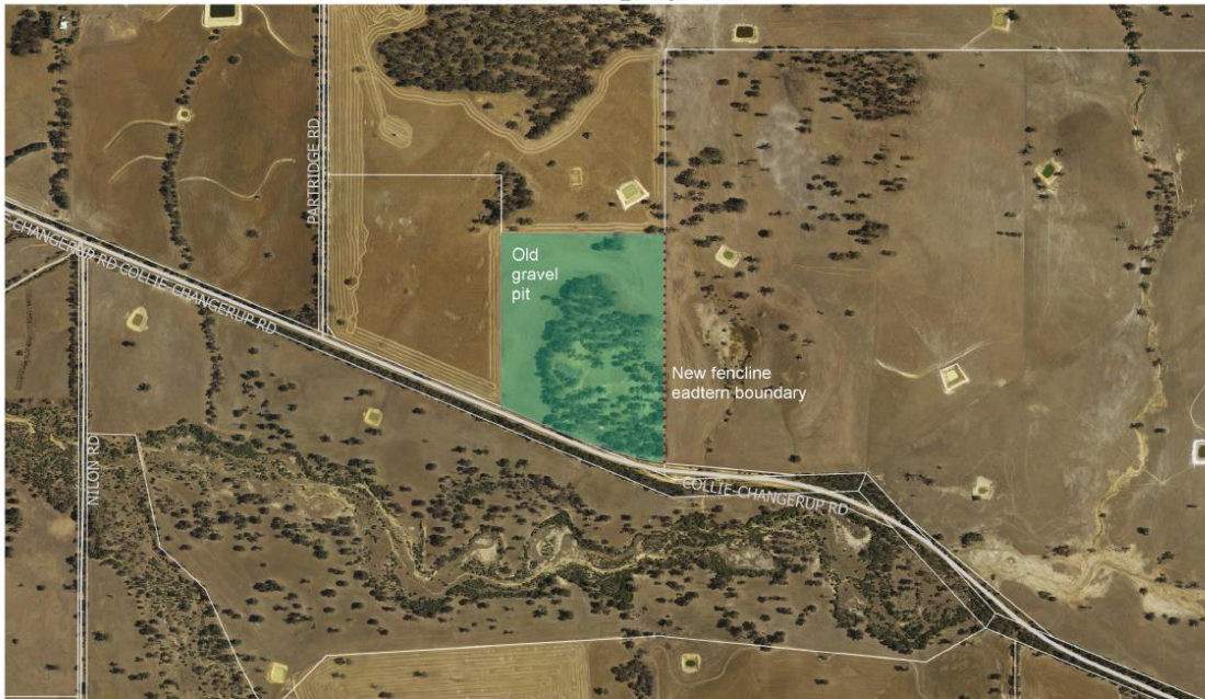
Gravel Pit - Collie-Changerup Road