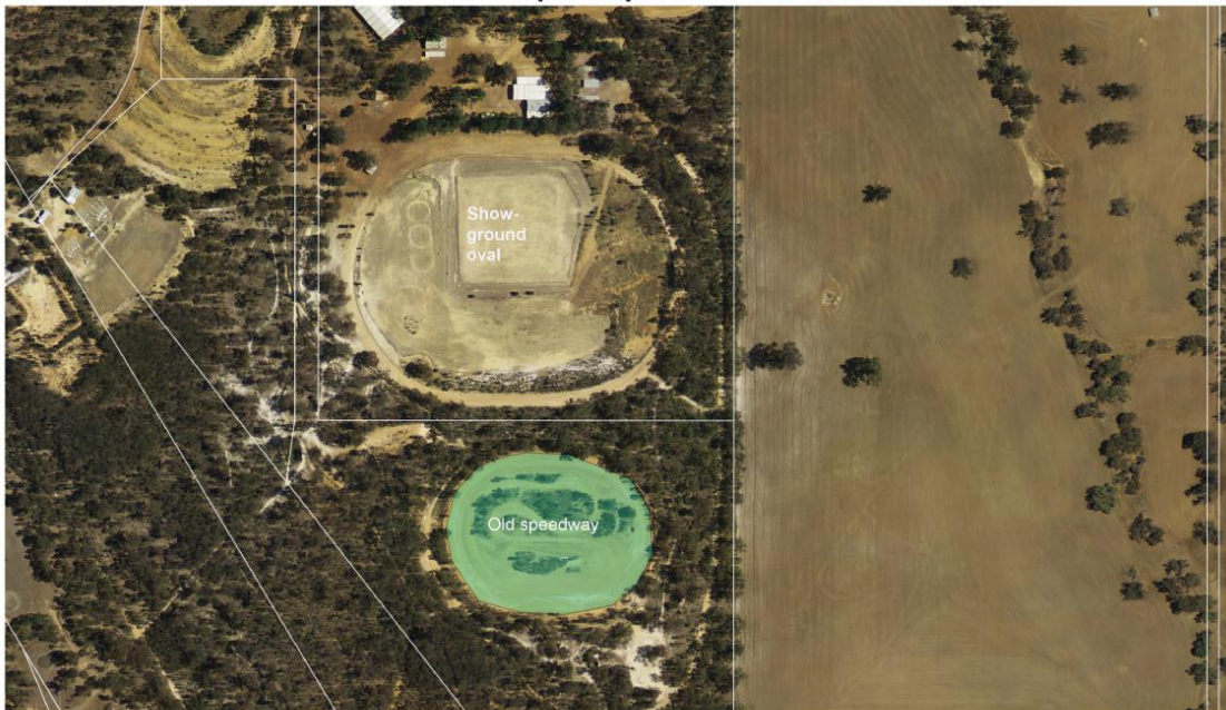
Old speedway site

Data Custodians: (c) Landgate (2017), Department of Parks and Wildlife, Department of Agriculture and Food Western Australia, Department of Water, Geoscience Australia. This project is supported by the South West Catchments Council through funding from the Australian Government and the Government of Western Australia. SWCC accepts no responsibility for damage, loss or injury caused by the use of information in this map document. SWCC does not warrant the accuracy or correctness of information supplied by third parties. Projection: Universal Transverse Mercator Zone 50 Datum: Geocentric Datum of Australia 1994 Date Printed: 2018-02-15T21:36:38